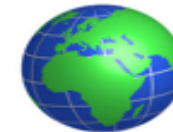
European Data Protection Supervisor